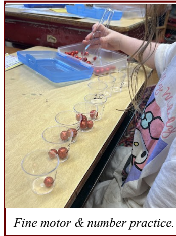
Fine motor & number practice.