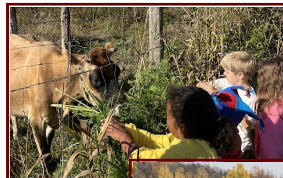
Feeding the cows.