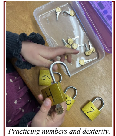
Practicing numbers and dexterity.