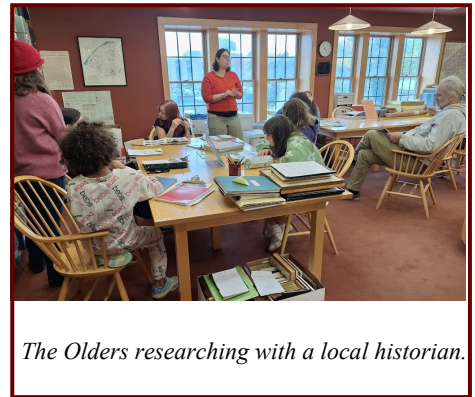
The Olders researching with a local historian.