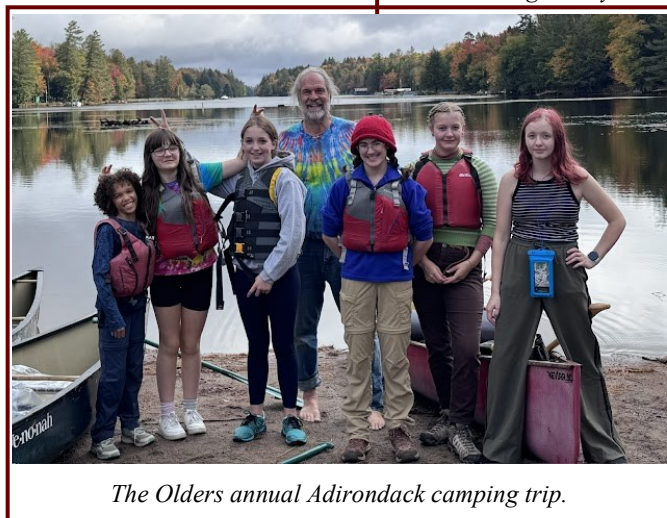
The Olders annual Adirondack camping trip.