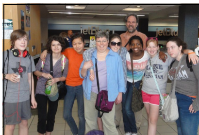
At the airport and ready to go.

traveled by ferry to the small island of Culebra for a two day adventure. Culebra is a tropical paradise with beautiful beaches, coral reefs and protected wildlife refuges. The people of this island have special commitment to protect this precious environment.