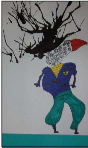
Inkblot by Ana Williams-Bergen

The title describes the Middles Room perfectly. The first thing everyone notices upon entering is the beautiful collage of collective art projects plastered to the walls. We have actually had pieces taped to the window for lack of wall space. The Middles love art class with all of its freedoms, color, real Bristol paper and an unending collection of media. They have